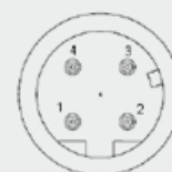
M12 4 Poles (Ethernet)

PIN 1: + 24 Vdc PIN 2: Reserved PIN 3: Ground PIN 4: Reserved