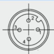
M12 4 Poles (Power supply)

PIN 1: + 24 Vdc PIN 2: Reserved PIN 3: Ground PIN 4: Reserved